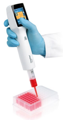
Multi dispensing with the HandyStep® touch and PD-Tip //

The HandyStep® touch saves time and prevents errors through automatic tip size recognition of the PD-Tips // from BRAND, with patented coding on the pistons. After inserting the tip, the size is automatically recognized and displayed, making it easy to select the volume to be dispensed. When a new PD-Tip // of the same size is inserted, all instrument settings are maintained.