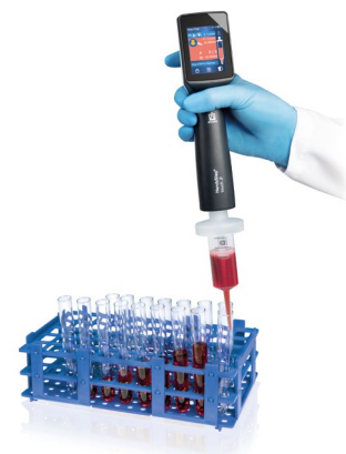
Sequential dispensing with the HandyStep® touch S and PD-Tip //