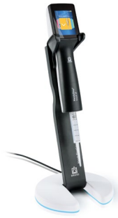
Charging stand with HandyStep® touch S and PD-Tip //