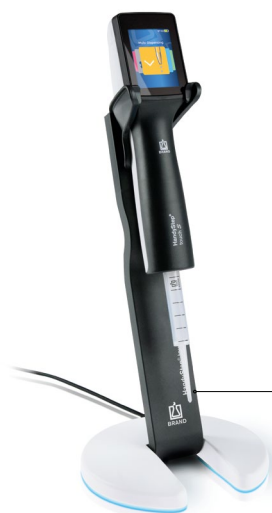
Charging stand with HandyStep® touch S and PD-Tip //

Ergonomically arranged STEP button for effortless volume filling and delivery